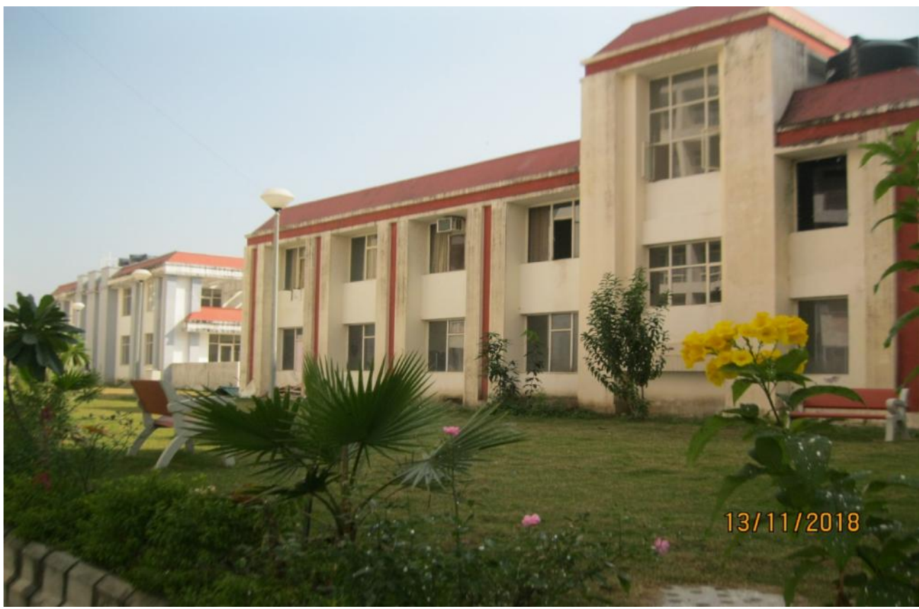
<u>Progress</u>:- Arbotriculture work is in progress. Work of Package-I is completed and handed over to AFNHB.

50% work is completed in Package-II and remaining work is in progress PDC for handing over is 31 Dec 18.