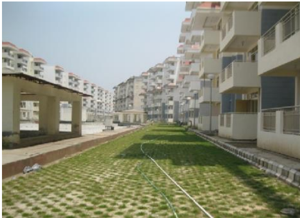
VIEW OF UPPER BASEMENT ROOF TOP DEVELOPMENT WORK